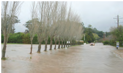
Without restoration, flooding on Olema-Bolinas Road will continue to worsen as sea levels rise.

Today, we are putting that vision into action and you can help! Residents, public agencies, local organizations, and other stakeholders are working together to restore habitats, protect wildlife, keep roads safe, and preserve the lagoon's stunning natural beauty. Numerous studies and ongoing monitoring of physical processes, habitat, and wildlife support these projects and help guide future planning.