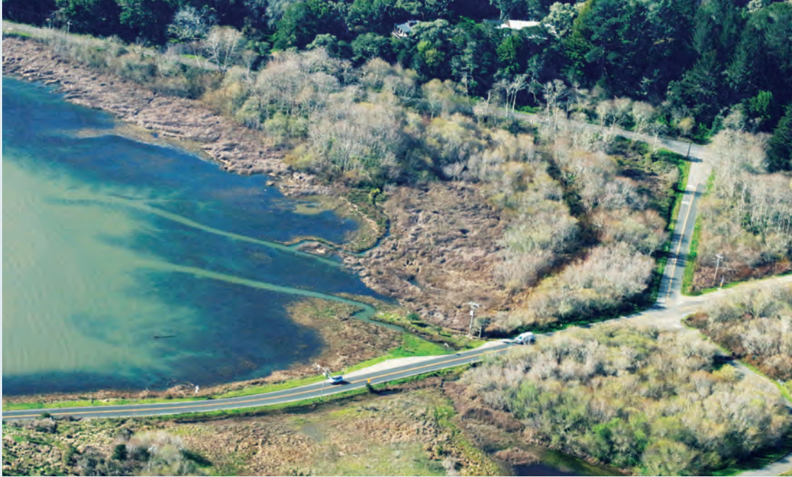
The Bolinas "Y" intersection at the north end of the lagoon is an example of how roadway development fragments habitats and prevents the lagoon from shifting in response to sea level rise.

BOLINAS LAGOON has existed in a state of constant change for over 7,000 years, as winds, waves, tides, and earthquakes sculpted its complex network of habitats. Yet, in less than 200 hundred years, human land-use changes have altered the lagoon's ability to shift with these natural processes. Climate change, and its accompanying storm surges, high tides, and sea level rise, will further challenge the lagoon's ability to adapt, threatening both its built and biological systems.